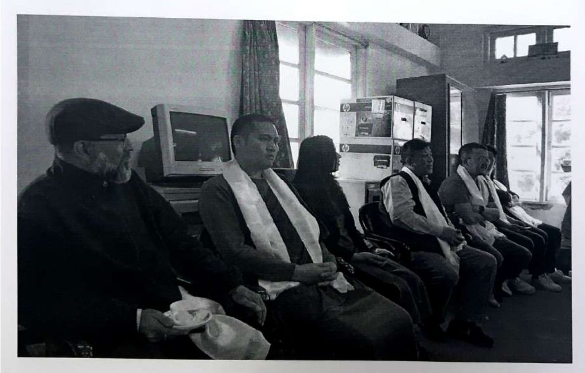
Discussing on the theme of the programme