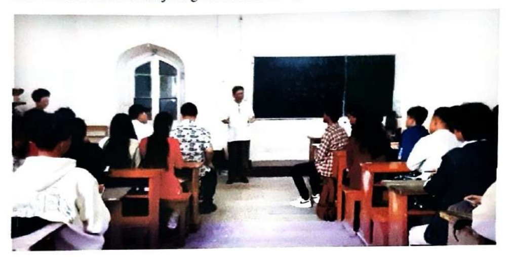
Vice Chancellor interacting with Students

and customs of South Korea which the students were keen on knowing about. The special lecture lasted for about sixty minutes after with the Vice Chancellor thanked the students, Department of Tibetan and Darjeeling Government College for having him over. He handed over pen to Department of Tibetan and books title "The Theory and Practice of Mantra" to both Department of Tibetan and Officer in Charge for the dedication that he witnessed in terms of student - teacher interaction. The team then went forward to visit the Department of Tibetan where they saw the books that were kept in the seminar library and then bid adieu to the Staff and students of Darjeeling Government College.