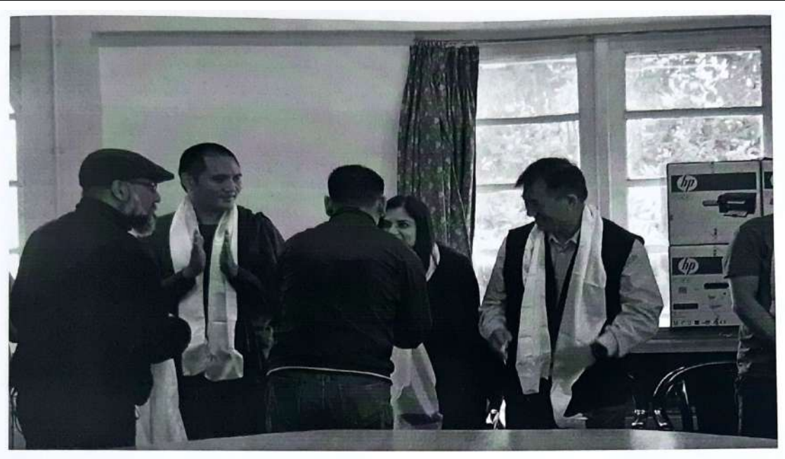
Welcoming the guest from Department of Buddhist & Tibetan Studies, Namgyal Institute of Tibetology, Gantok

Phone / Fax: (0354) 2254078 (0354) 2254019 Email : dgc.principal@gmail.com